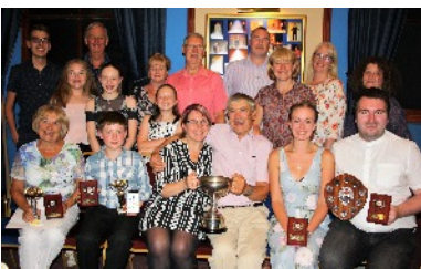
Kingsley Players celebrate after their most successful night ever at the Cheshire Theatre Guild Awards

For more inform check out the Kingsley Players website www.kingsleyplayers.co.uk .